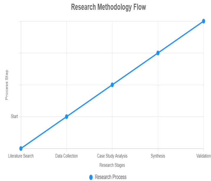
Figure 2: Research Methodology Flowchart

5. Validation: Findings were cross-referenced with recent studies and industry reports to ensure accuracy and relevance. The analysis revealed several key trends that are shaping the future of the industry. These trends include the increasing adoption of artificial intelligence and machine learning technologies, a growing focus on sustainability and environmental responsibility, and the rise of remote work and digital collaboration tools. Furthermore, the research highlighted the importance of adaptability and innovation in maintaining a competitive edge in today's rapidly evolving business landscape.